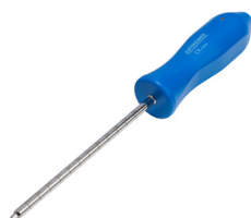
0010-C Metallic screws screwdriver