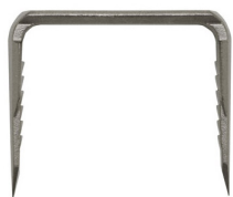
Adult arthrodesis staple