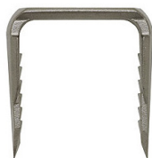
Paediatric arthrodesis staple